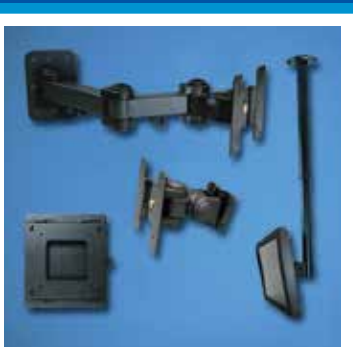
Standard VESA Configuration Fits a Variety of Wall and Ceiling Mount Brackets