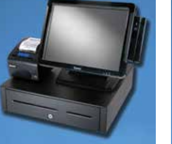
Two Cash Drawer Ports Supports Optional Cash Drawers