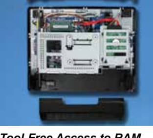
Tool-Free Access to RAM Optimizes Serviceability