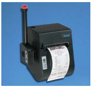
Optional Audio/Visual Print Messenger