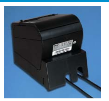
Optional Power Supply Cover with Cable Management Slots