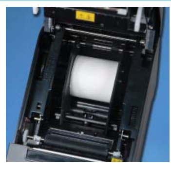
Drop and Print Paper Loading with an Adjustable Paper Width Selector