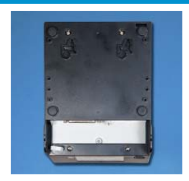
Built-In Wall Mount Capability